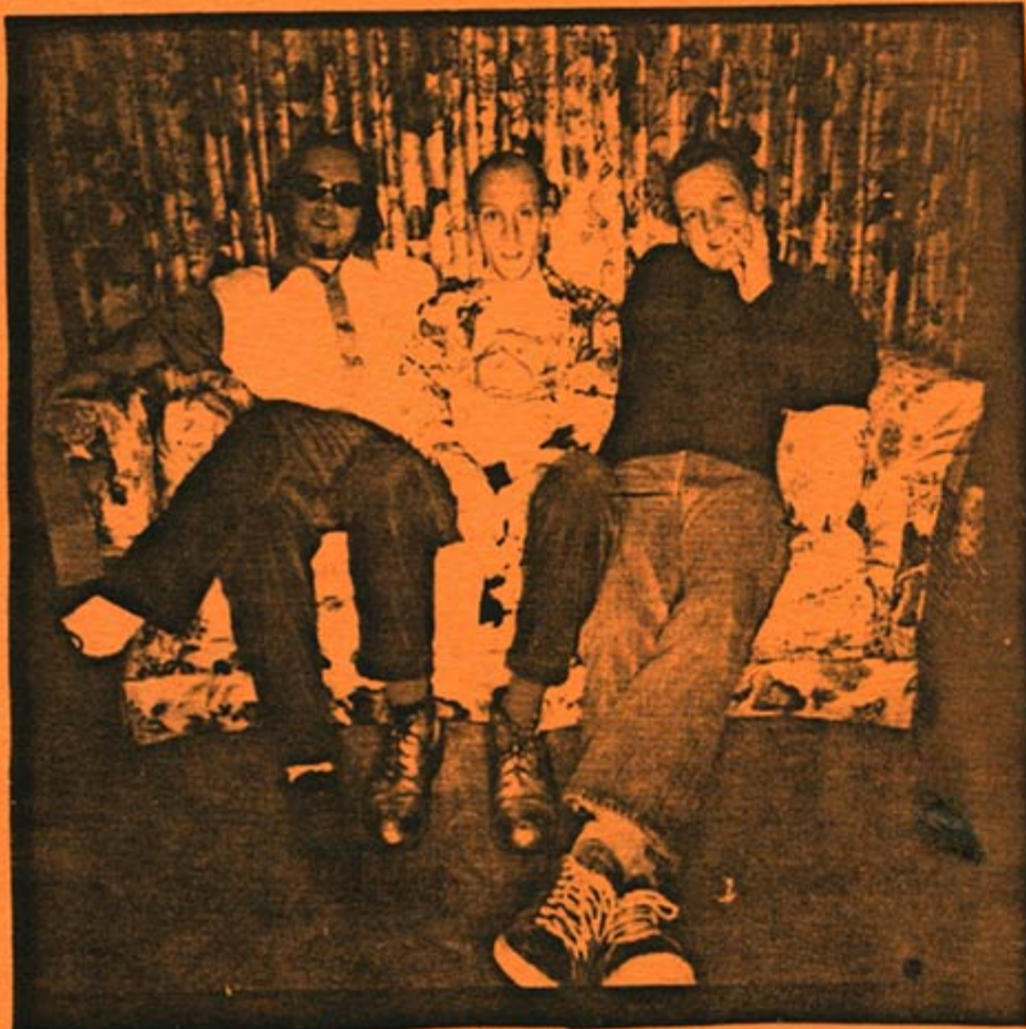
the presidents recline

*Remember, we automatically send you p.u.s.a. tour date information when the Presidents of the United States of America are coming to your part of the world!